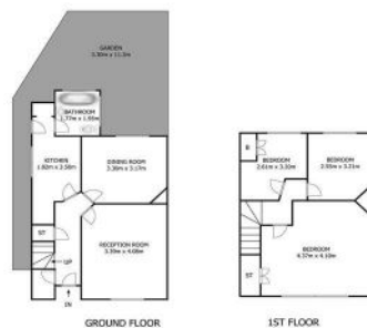
Green Walk, DA1 43P

This plan serves solely as a layout guide, and no liability is assumed for errors, omissions, or inaccuracies. It was developed in accordance with the RICS Code of Measuring Practice. All dimensions, including windows, doors, and the Total Gross Internal Area (GIA), are estimated and measured internally. For accurate measurements, please consult a certified architect or surveyor prior to making any decisions based on this plan. www.airvideography.com