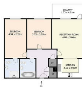
Craft Court, Bexleyheath, DA6 7BF