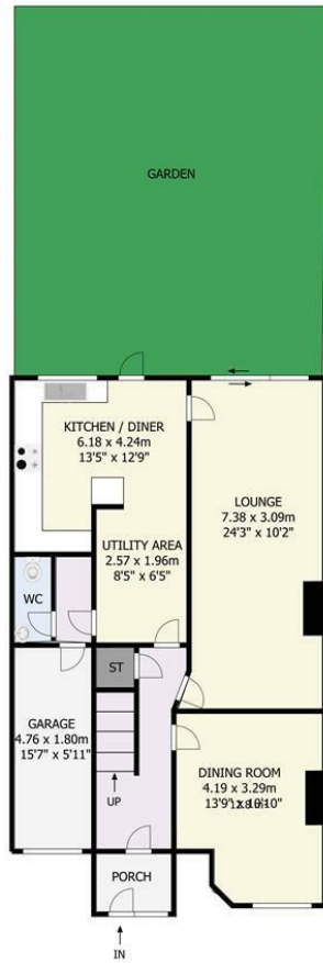
Ground Floor JAMES RD DA1 3NF