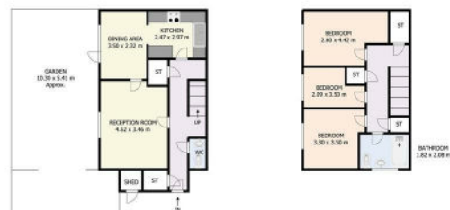
Ground Floor Walsley Close, Crayford, DA1 4BB

This plan serves solely as a layout guide, and no liability is assumed for errors, omissions, or inaccuracies. It was developed in accordance with the RICS Code of Measuring Practice. All dimensions, including windows, doors, and the Total Gross Internal Area (GIA), are estimated and measured internally. For accurate measurements, please consult a certified architect or surveyor prior to making any decisions based on this plan.