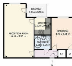
Beech Haven Court, Crayford, DA1 4EB

This plan serves solely as a layout guide, and no liability is assumed for errors, omissions, or inaccuracies. It was developed in accordance with the RICS Code of Measuring Practice. All dimensions, including windows, doors, and the Total Gross Internal Area (GIA), are estimated and measured internally. For accurate measurement please consult a certified architect or surveyor prior to making any decisions based on this plan. The first measurement provided refers to the vertical wall.