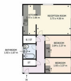
Woodfall Drive, Crayford, DA1 4TN

This plan serves solely as a layout guide, and no liability is assumed for errors, omissions, or inaccuracies. It was developed in accordance with the RICS Code of Measuring Practice. All dimensions, including windows, doors, and the total gross internal area (GIA), are approximate and measured internally. All measurements have been taken at the widest points unless otherwise stated. The first measurement provided refers to the vertical wall. For accurate measurement please consult a certified architect or surveyor prior to making any decisions based on this plan.